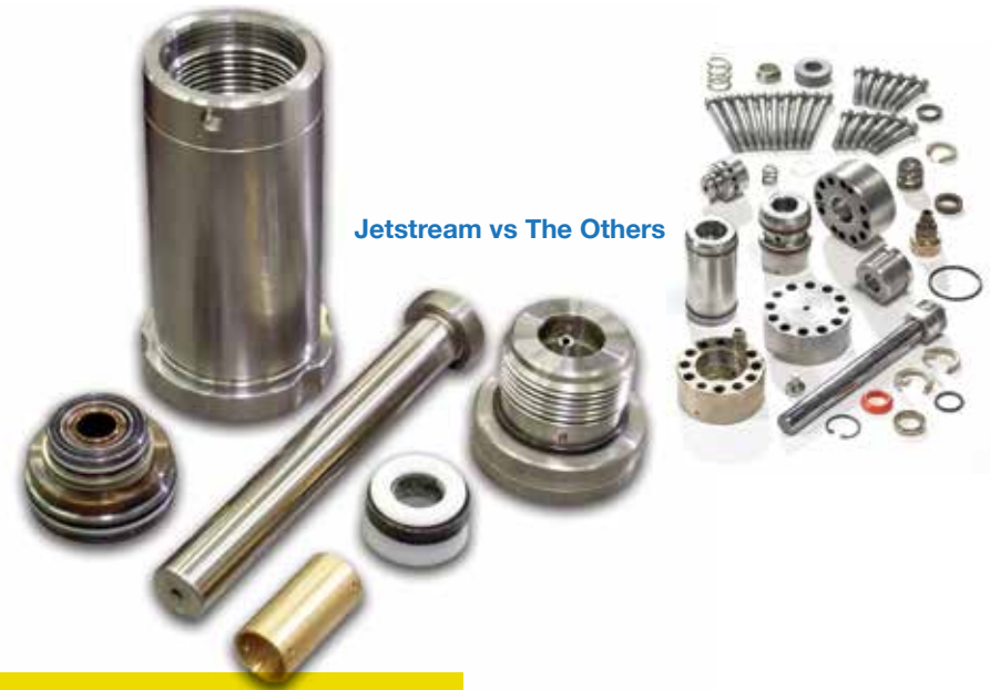
Jetstream vs The Others